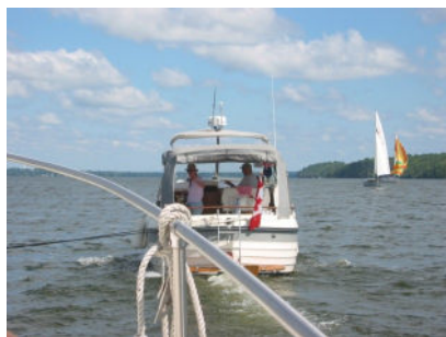
Boaters Helping Boaters