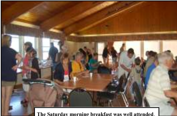
The Saturday morning breakfast was well attended.