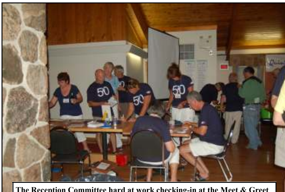
The Reception Committee hard at work checking-in at the Meet & Greet.

Safe boating is better than the alternative