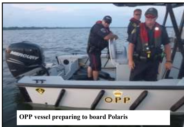
OPP vessel preparing to board Polaris

At approximately 2015 on Wednesday August 08, the CFB Trenton Yacht Club sail race committee boat, Polaris, had lowered the flag and just completed hoisting anchor. The crew was making ready and I was on the stern bench doing time calculations. I turned my head and noticed an OPP Marine Unit boat (see photograph for details) advancing toward our vessel, totally unnoticed by the racing committee crew. I advised the crew to prepare to be boarded.