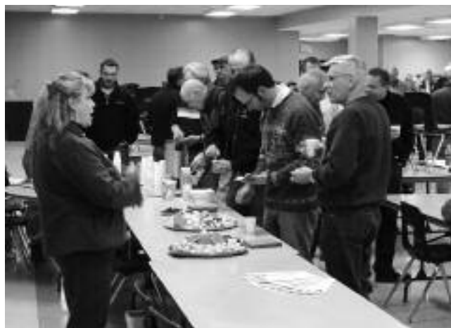
Above: Cider Night with Winter Students