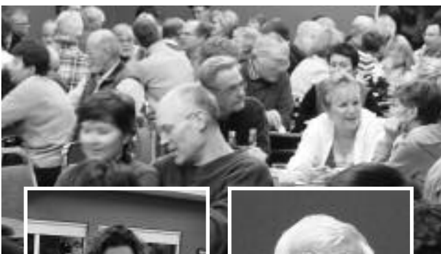
Below: Pizza Night & Great Lakes Presentation