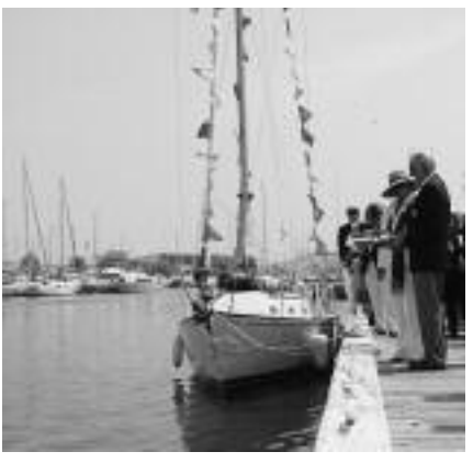
Placing of the wreath at the RHYC Blessing of the Boats June 2, 07.