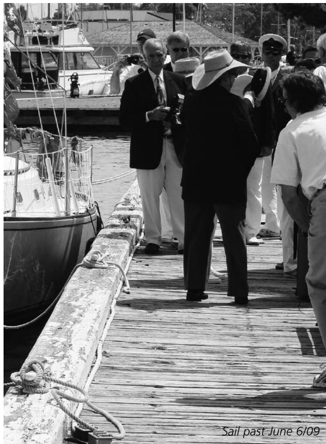
Sail past June 6/09