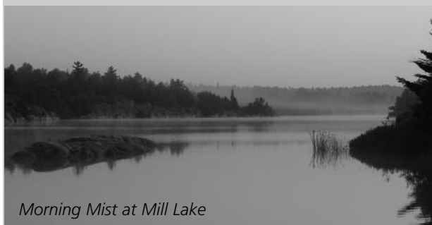
Morning Mist at Mill Lake

Go to the following website www.cps-ecp.ca Login and click on Member Services- then click on Member Benefits.