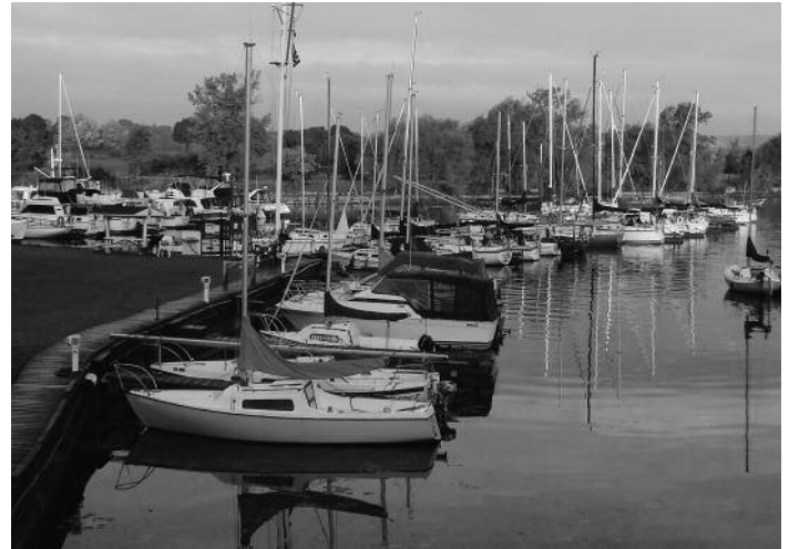
Looking toward Pier 4 Park from the verandah in the morning at MBYC

Vicky Grimshaw 905-628-0645 or e-mail cici@nas.net