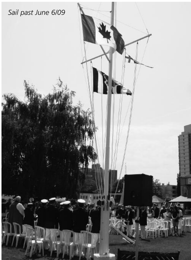
Sail past June 6/09