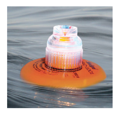
Sirius Signal SOS Distress Light (not an epirb)