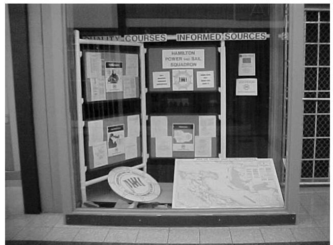
HPS DISPLAY WINDOW AT JACSON SQUARE