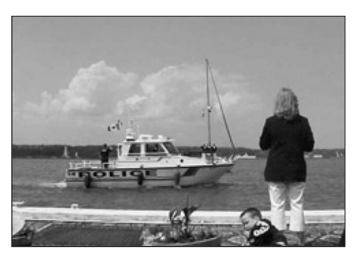
The Hamilton/Halton police boat receiving the salute at the RHYC Sail Past.