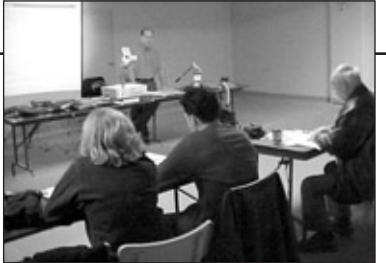
Hamilton Power & Sail Squadron safe boating classes.