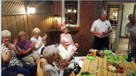
Fun at the Commander's BBQ!