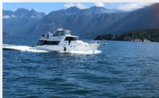
Beautiful day to be on the water, thank you Melissa