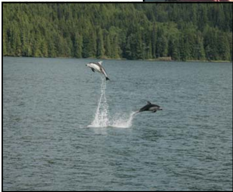
Pacific Dol- phins at Wahkana Bay, Brough- tons