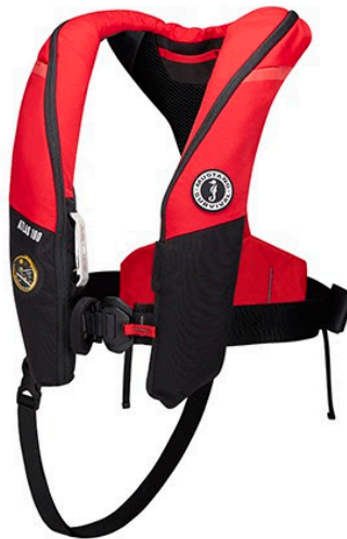
Atlas 190 DLX Pro Sensor Life Jacket named TIME Best Invention of 2024

The Atlas 190 DLX Pro Sensor Life Jacket, created by Canadian company Mustang Survival, has been awarded the prestigious TIME Best Invention of 2024 in the Outdoor category. Developed for offshore sailing, cruising, and boating, the Atlas 190 DLX combines unparalleled comfort with cutting edge safety features, including a re-engineered bladder for superior turning performance... Read More