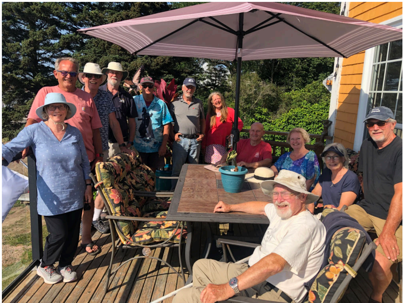
Bluenose II Event This event took place on July 30th at Indian Point