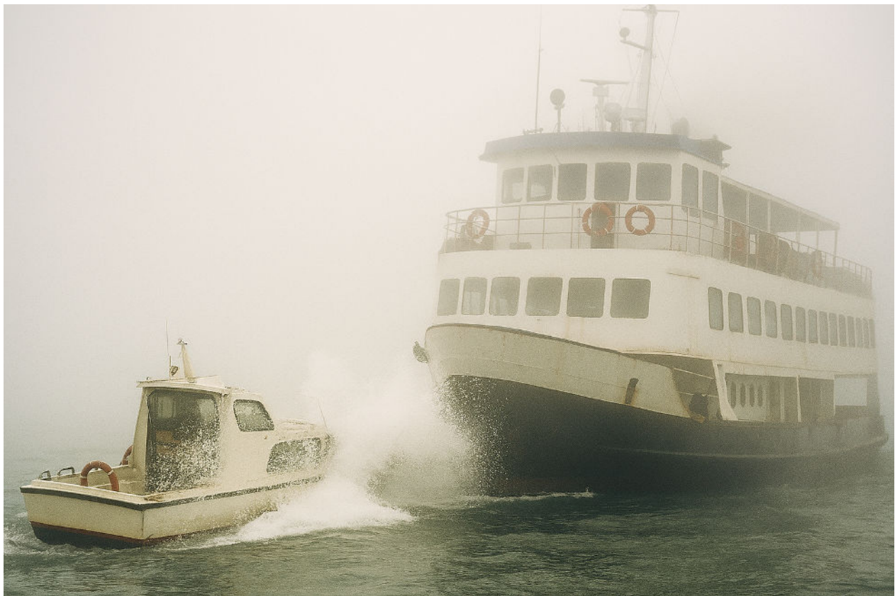
Editor's note: photo created with Co-pilot AI

The Transportation Safety Board investigates marine accidents of note, always searching for root causes to determine recommendations to save life and property in the future. Lately two of these investigations involved pleasure craft. One of these is presently under investigation, the other concluded: “although the pleasure craft operator involved in this occurrence had completed an accredited boating safety course and held a valid Pleasure Craft Operator Card, his knowledge of signals, lookout, safe speed, collision avoidance, and navigation in restricted visibility was limited. The pleasure craft had a simple passage plan for the intended voyage, but the craft’s occupants were unfamiliar with the navigation area and were unaware of the presence of a ferry service. The pleasure craft operator therefore did not have sufficient knowledge to navigate safely in the prevailing conditions at the time of the occurrence.”