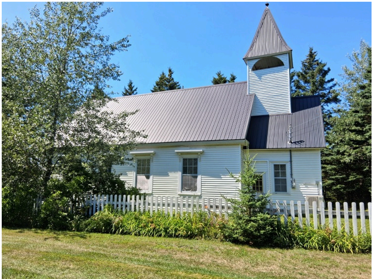
Proprietor/Hostess Hilary in the gift shop & museum with us.