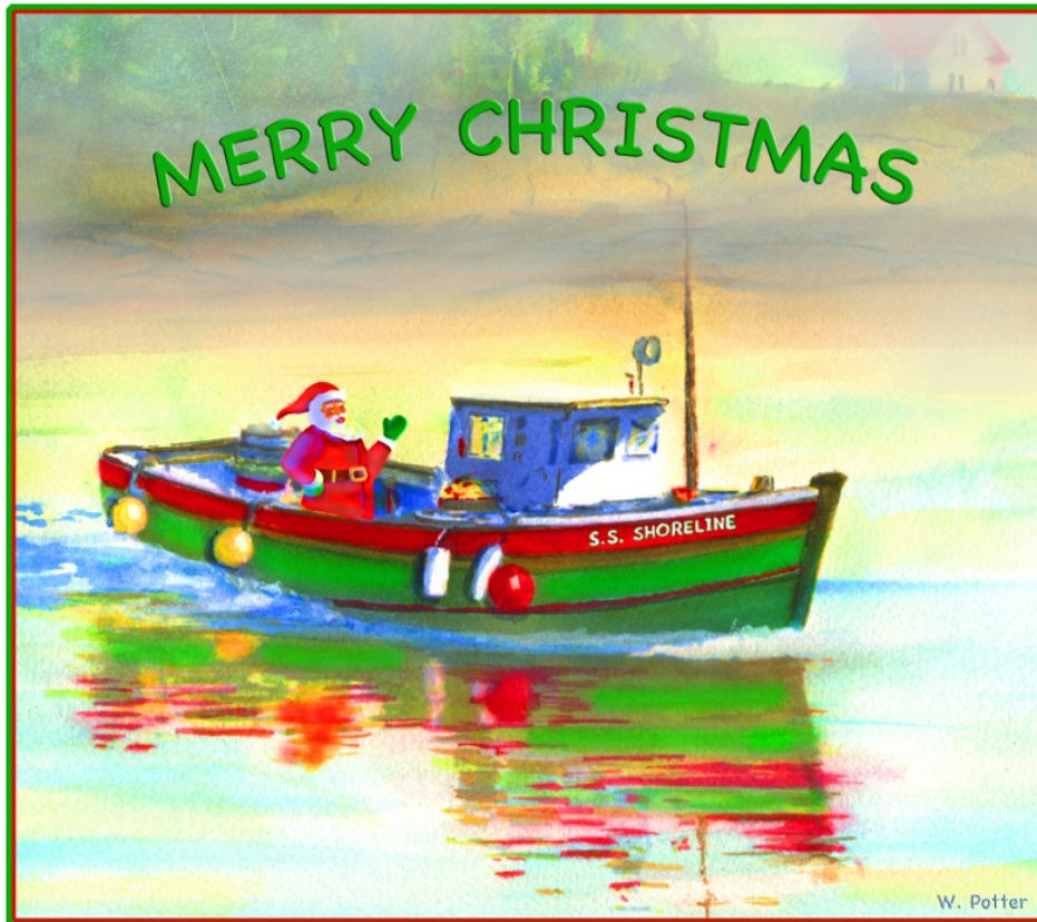
Art & Cartoons by Whitney Potter